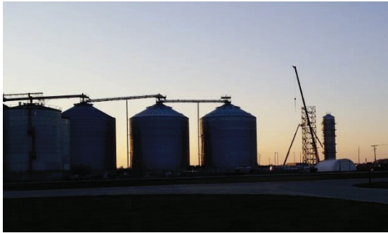
The Cardinal Ethanol Plant near Union City, Indiana, processes approximately 36 Million bushels of corn each year into ethanol.

Ethanol has been a clean-burning fuel used in the United States since the 1850s. Ford's Model T automobile was designed to run on ethanol, and while ethanol was banned during the Prohibition era, it gained traction in the 1970s at a time of high gas prices and concern around oil imports. Ethanol made a major come-back when the Renewable Fuel Standard was initiated by Congress in 2005 to set some minimum requirements for using renewable fuels, and now, about 14 billion gallons of ethanol are added per year to gasoline consumed nationwide.